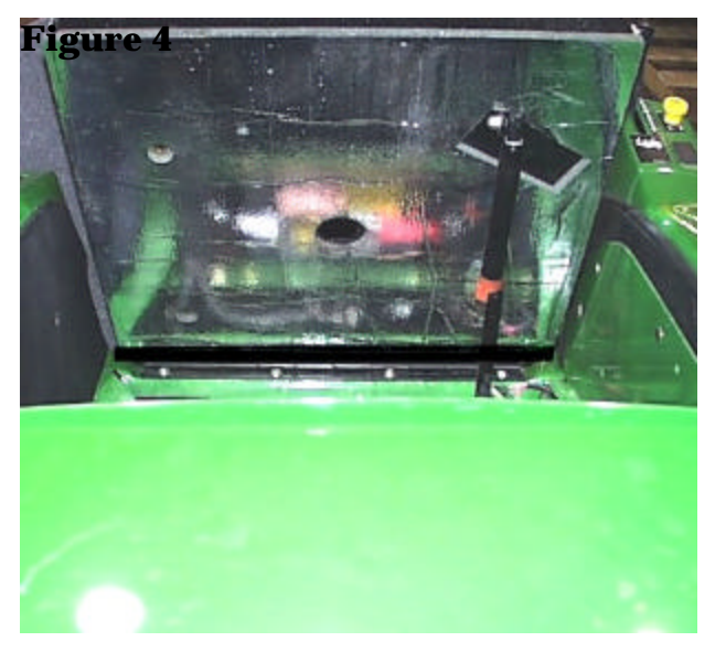
5. Open the left door and right escape window before proceeding with the

4. Take the \frac{1}{2} " x \frac{3}{4} " NDAX and position it against the seat plate near the hinge as shown in Figure 4. Peel back the adhesive and glue into place.